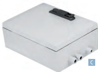
Robust housing with three cable entry points and swivel lever