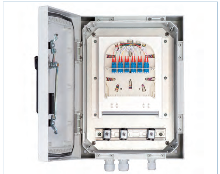
RDB equipped with 6 LC Duplex adaptors and 12 OS2 pigtailed

If the box needs to be fixed to a signal mast, an additional adapter plate is available which can be mounted onto the distribution box.